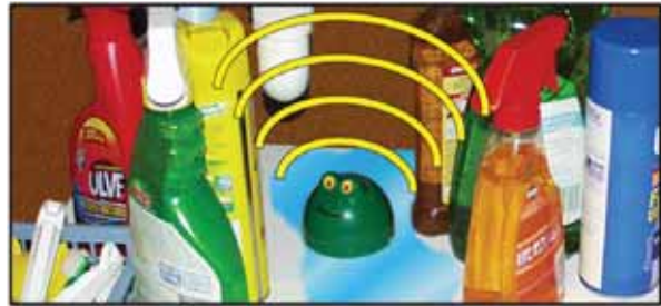
LeakFrog Can Provide Instant Warnings by Sounding an Alarm When Water Puddles.

Water is the Most Common Cause of Home Damage, More Likely Than Fire*