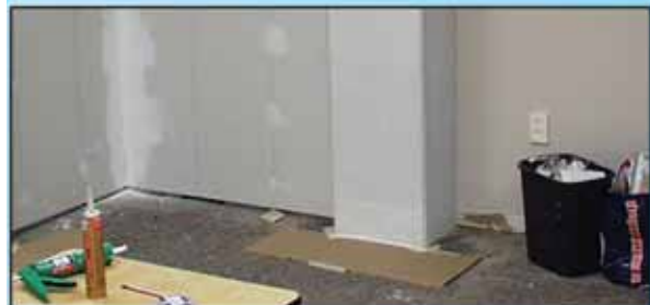
Water Damage Repairs Average $5,000.